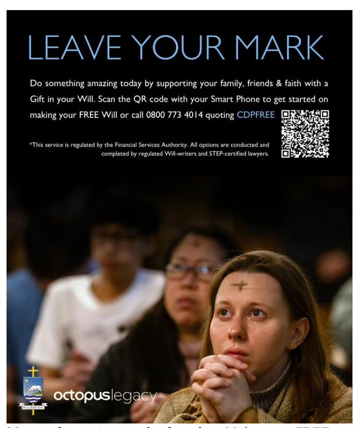
More information can be found at: <u>Make your FREE</u> Will - Catholic Diocese of Portsmouth, [portsmouthdiocese.org.uk]

The Parish Office will be closed for the first two weeks of July, re-opening on Tuesday, 16<sup>th</sup> July at 9 am.